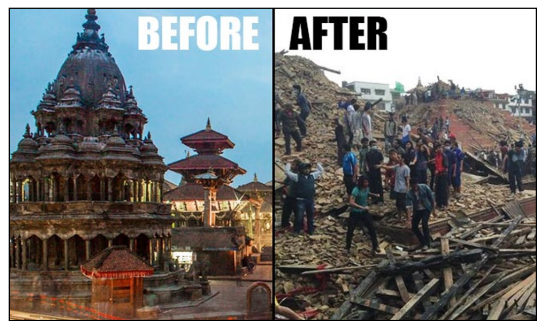
This photo illustrates how an earthquake destroyed a World Heritage site in Nepal in 2015. It is beyond repair and is now lost to future generations.

Heritage is unique and often times cannot be replaced if damaged or destroyed. Recent armed conflicts in the Middle East and elsewhere have resulted in the destruction of many historical and archaeological treasures, some nearly 2,000 years old. These tangible heritage objects and places are now lost forever. People in the future will only be able to see them in pictures. Other threats to cultural and natural heritage sites include natural disasters, weather, erosion, pollution, deforestation and other human caused or natural events. In some cases, conservation efforts can restore heritage sites.