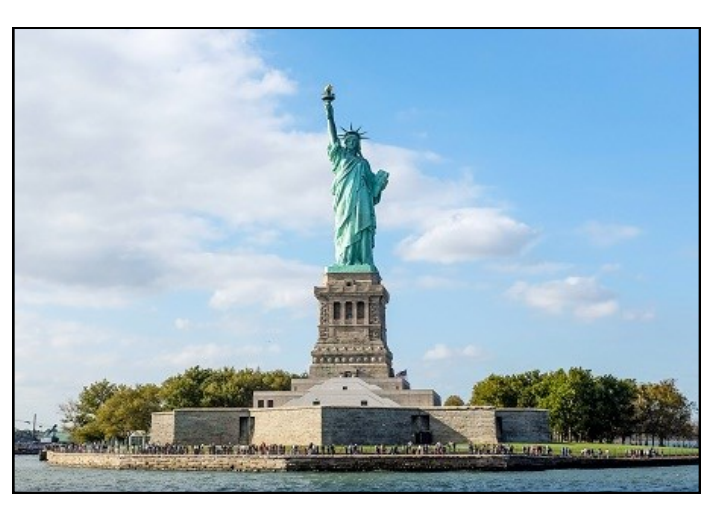
Statue of Liberty. Inscribed as a World Heritage Site in 1984.

Across the globe, it is a high honor to have a heritage site recognized as a World Heritage Site. In addition, in many cases, tourists will visit a site just because it has become a World Heritage Site. This in turn, creates jobs and revenue for the communities where these sites are located.